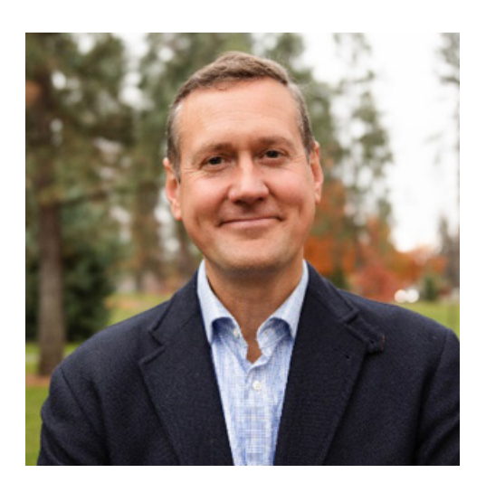
Whitworth Lecture: Why Virtuous People Won't Save the Earth April 26

Enjoy works depicting urban environments from two internationally-recognized Spokane printmakers.