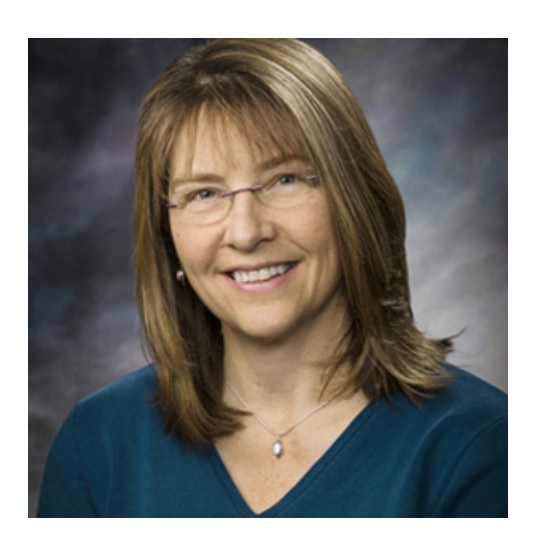
WSU Health Sciences Spokane Lecture: Our Global Climate Crisis: What Can and Should Healthcare Do?