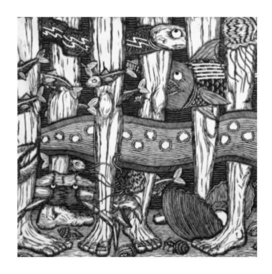
Saranac Art Projects April Exhibition