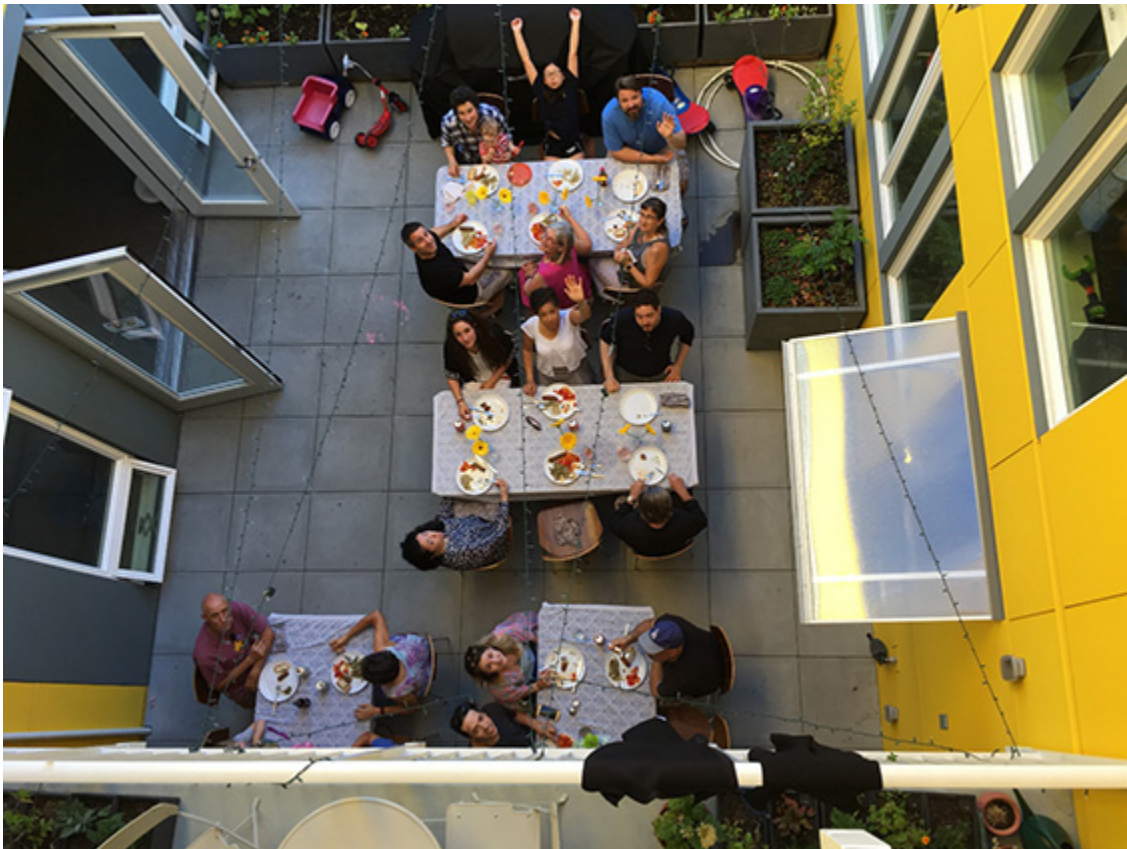
Dinnertime at the Capitol Hill Urban Cohousing village.