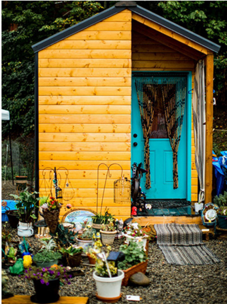
Kenton Village, Portland: A CPID housing village for homeless women.