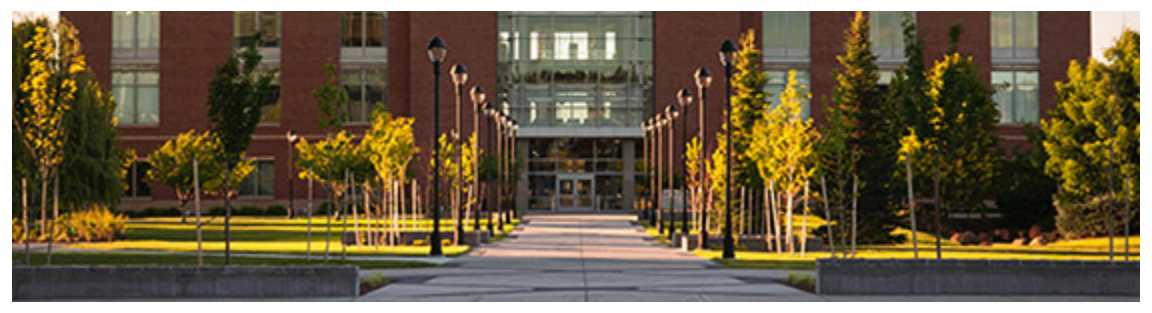
The East West Life Sciences Summit June 13 reception to be held at the WSU Student Academic Center (above) and June 14 Summit at the Pharmaceutical and Biomedical Sciences (SPBS) Building.