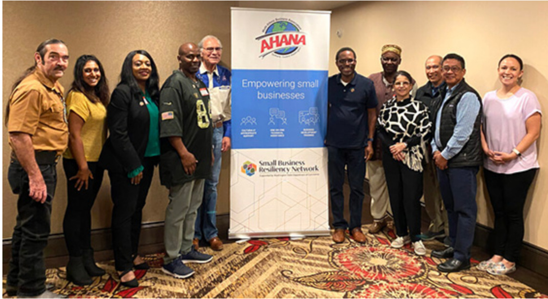
AHANA Board of Directors and staff.