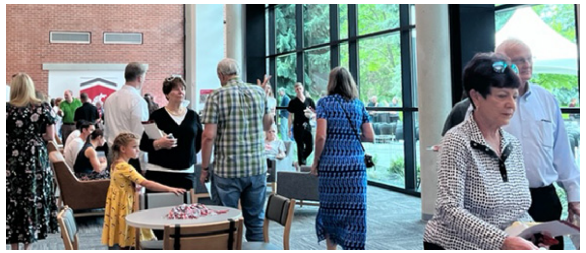
Renovations included removing the former rotunda/auditorium at the front of the building which opened up sightlines to the WSU Health Sciences Spokane campus to the west. The new ground-floor lounge provides a bright, open, and inviting space for student to gather.