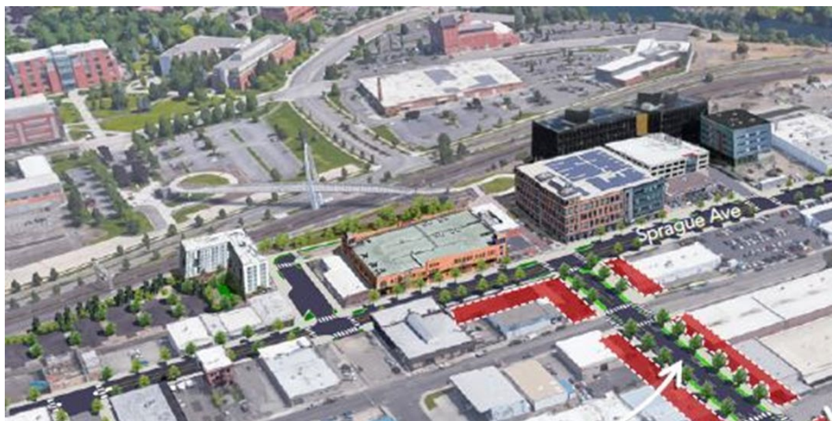
TOD Study illustration by Center-Based Planning of South University District and hypothetical 400-Block development